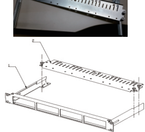
3.4 Fix the panel in cabinet with screws