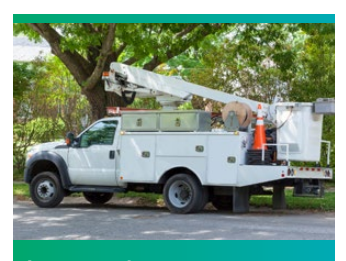
Improved management and service efficiency

Many of today's existing OLTs have been designed for high-density environments, which leads to inefficiencies in hardware utilization when they are deployed in rural markets. In our study, the use of R-OLTs delivered significantly higher hardware utilization due to their ability to be deployed with low initial port counts and scaled through the addition of ports and the transition from a 1:128 split ratio to a 1:64 split ratio when more bandwidth capacity is required.