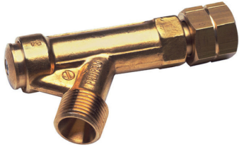
Automatic shut-off Valve for Torch Tool