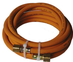
High Pressure Hose for Torch Tool, 4 meters