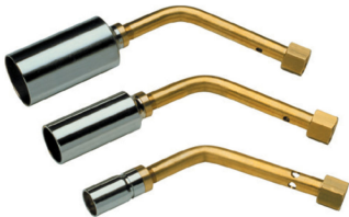
Burner Head for Torch Tool, 28 mm nozzle