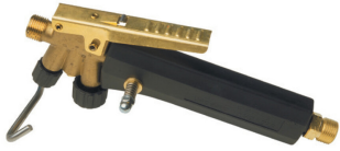
Handgrip Burner handle for Torch Tool