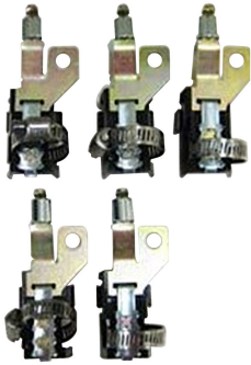
Mini-OTE 300-Series, Optical Terminal Pole Cable Retention Kit