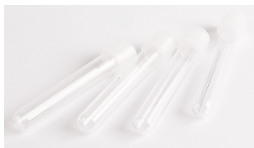
Music Wire, 4 vials+C19