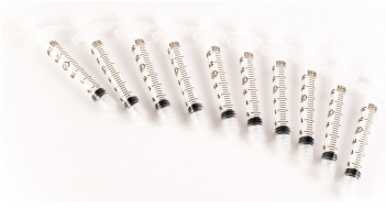
Syringe, 3CC, quantity 10