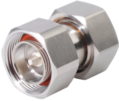
7-16 DIN Male to 7-16 DIN Male Low-PIM Adapter