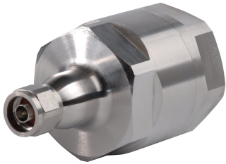
Type N Male Positive Stop™ for 1-5/8 in LDF7-50A cable