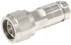
Type N Male Positive Lock for 1/4 in LDF1-50 cable