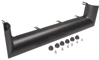
FiberGuide® Trumpet Flare, 4x24in, Black