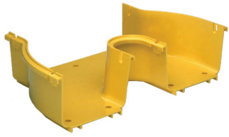
FiberGuide® Straight Reducer, 4x12 to Dual 4x6in, Yellow