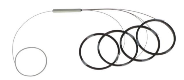
OP91S32S -EQ-N0-00 1x32 Splitter in Non-ruggedized Package (actual product photo, shown approximately quarter scale)

Two examples are shown below. Output split ratio percentages are printed on the labels of ruggedized packages.