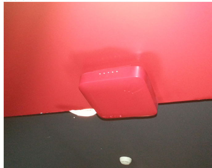
BELOW: A Ruckus R700, 802.11ac access point painted red, provides service within the Fiera's huge auditorium.