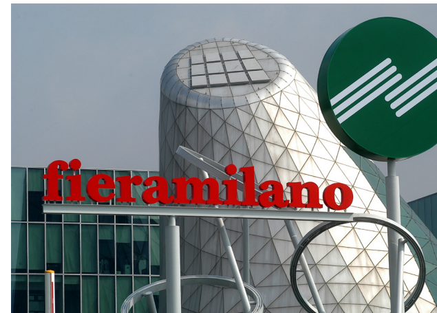
ABOVE: The 3rd largest exhibition center in the world, Fiera Milano is delivering Wi-Fi location information and analytics to its customers as a revenue generating service.

Yet just getting Wi-Fi to work at all within busy exhibitions is one of the industry's biggest challenges. Fiera Milano's legacy Wi-Fi network was a case in point as it simply wasn't capable of delivering the level of concurrent client capacity, performance, interference mitigation or location services required to realize the Fiera's vision of Wi-Fi.