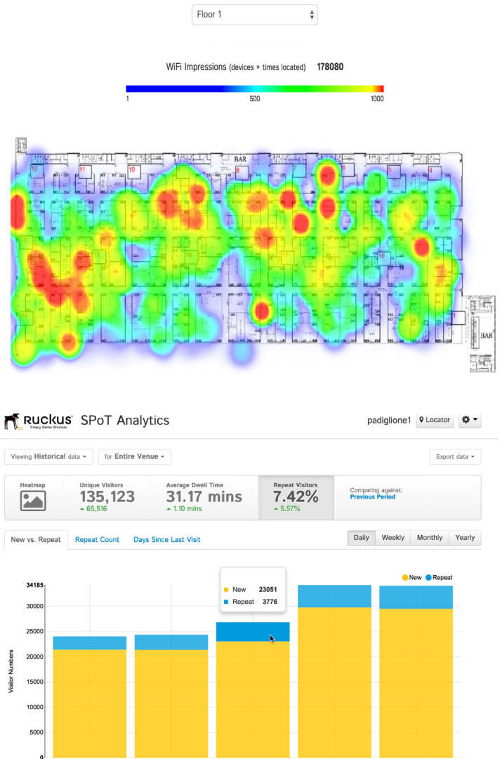
ABOVE: Ruckus location based service gives FASTWEB at-a-glance real-time and historical WI-Fi location data.