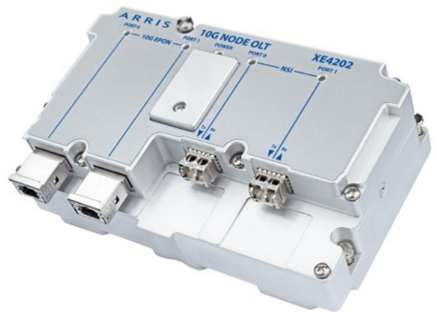
Shown with XFP and SFP+ Transceiver Optics