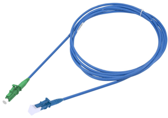
Fiber Optic Patch Cord, 1.7 mm simplex, singlemode, RBR, blue