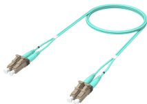
Fiber Optic Patch Cord, Duplex, OM3, LC/UPC to LC/UPC, LSZH, Aqua