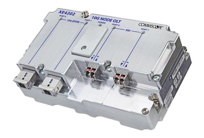
CommScope PON Evo 200E Series R-OLT

For subscriber access, the 200E Series R-OLT includes two XFP ports, each supporting coexistent symmetric 1G EPON, 2/1G Turbo EPON, and 10/10G EPON in co-existence mode. Each PON port fully supports interoperability via DPoE V2.0 OAM and supports 128 ONUs for a total of 256 subscriber ONUs per R-OLT module.