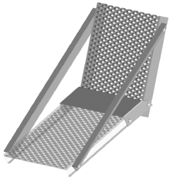
Extension Kit, safety grating